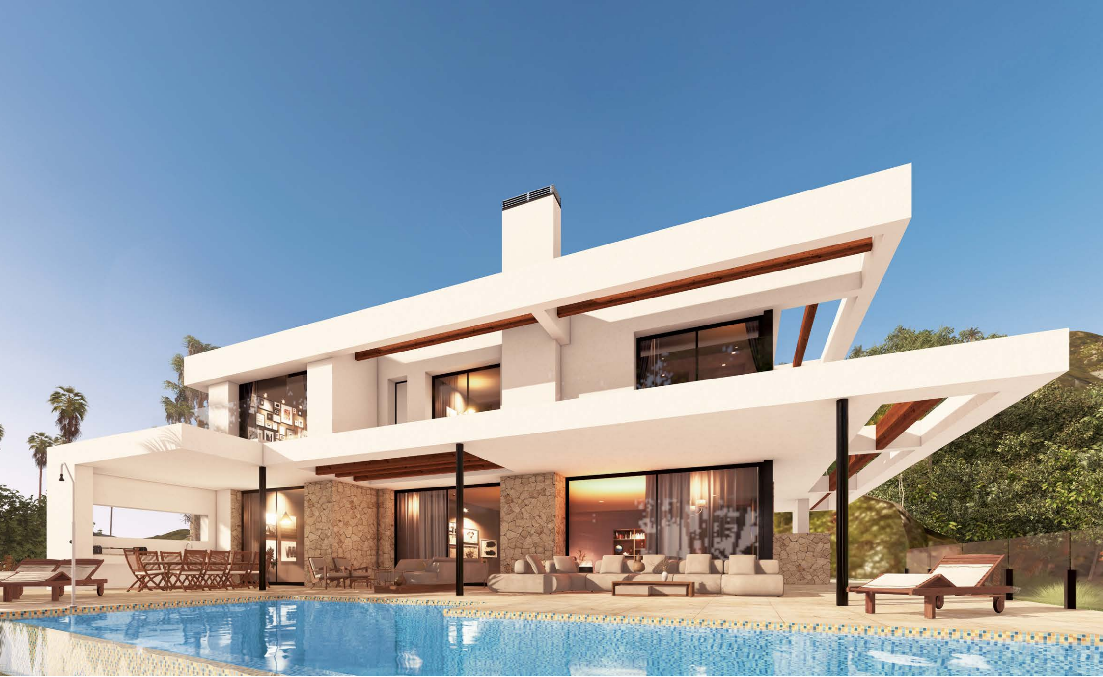
La Cala - Chaparral Golf Villas