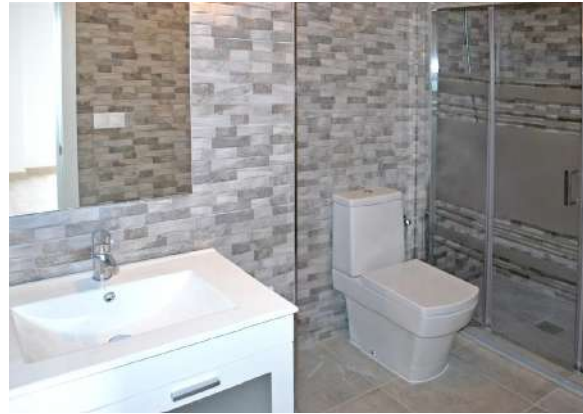
Benalroma | Benalmádena Costa, Málaga