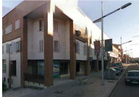
Avda. de Madrid Building | Toledo