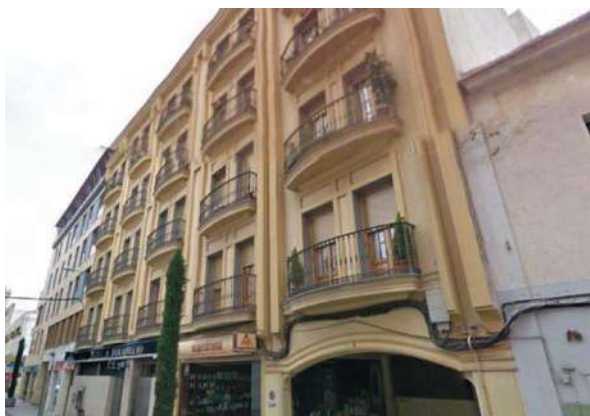
Arroyazo Building | Don Benito, Badajoz