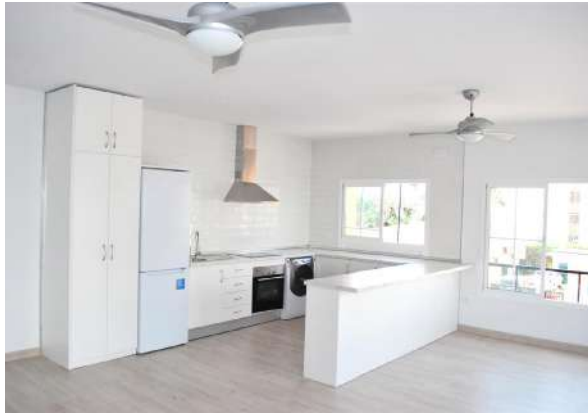
Benalroma | Benalmádena Costa, Málaga