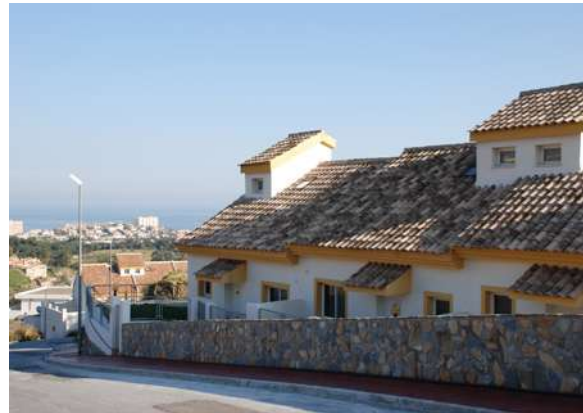
Villas La Viñuela Residential Complex | Benalmádena, Málaga