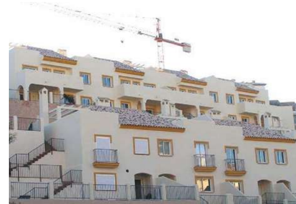
Torreblanca I Residential Complex | Fuengirola, Málaga