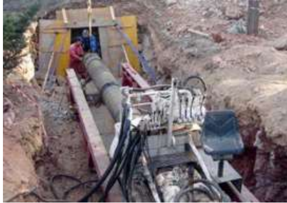
Sewerage SP-1 | Benalmádena, Málaga