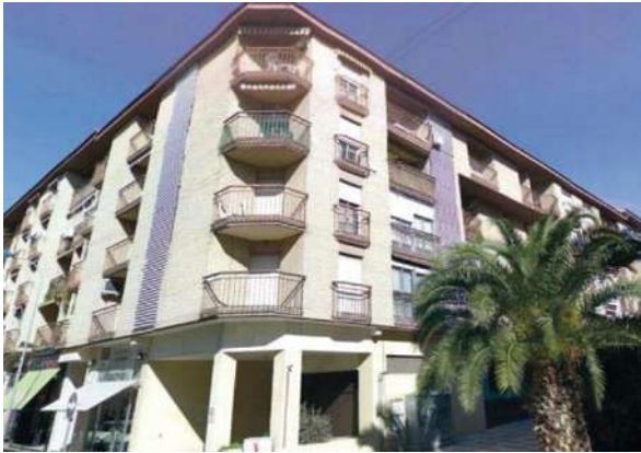
Barrio Sta. Teresa Buildings | Toledo