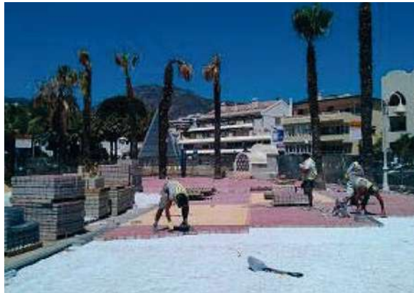
Pza. de las Velas | Benalmádena, Málaga