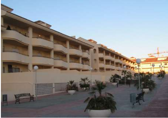
Panoramic Residential Complex | Arroyo de la Miel, Benalmádena, Málaga