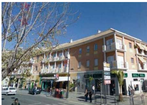
Building in Palma del Río | Córdoba