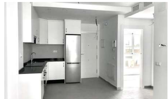
La Cala Beach | La Cala de Mijas, Málaga