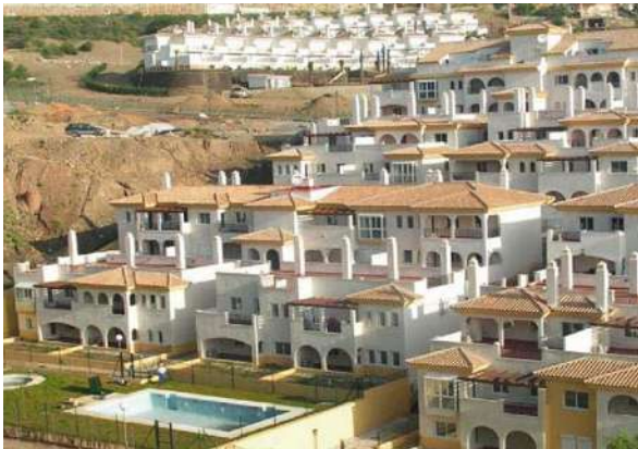
Los Nadales II Residential Complex | Benalmádena, Málaga