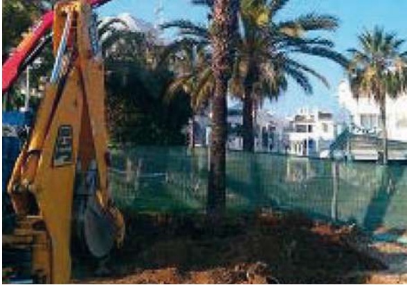
Gardening-Sports Marina | Benalmádena, Málaga