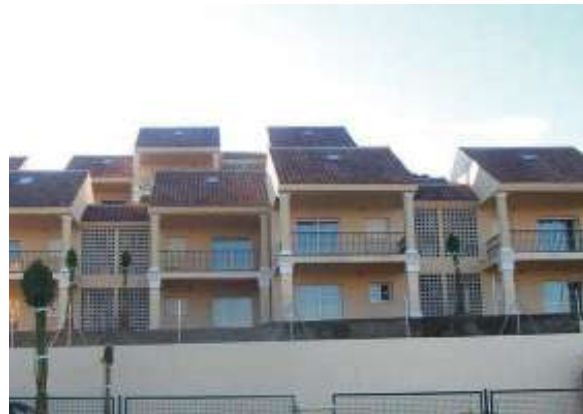
Pueblo Mediterráneo Aparments | Torremuelle, Benalmádena, Málaga