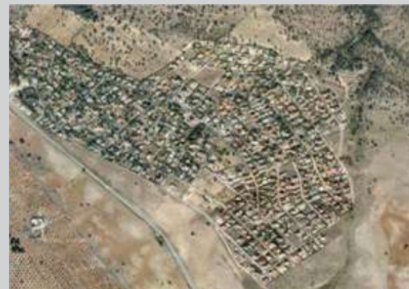
Las Nieves Phase II | Nambroca, Toledo