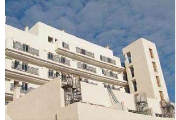
La Colina Residential Complex | Benalmádena, Málaga