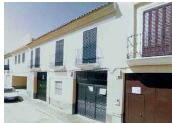
Building in el Arahál | Sevilla