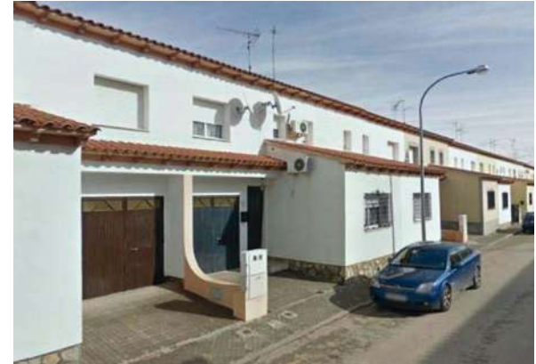
Terraced houses in Quintanar de la Orden | Toledo