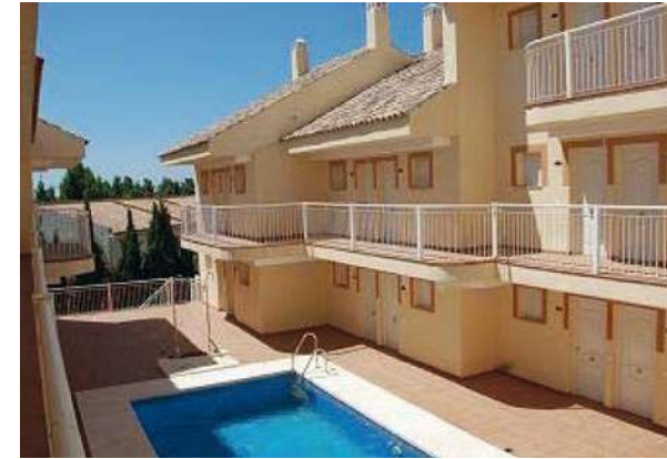
Hotel - Tourist aprmts. | Arroyo de la Miel, Benalmádena, Málaga