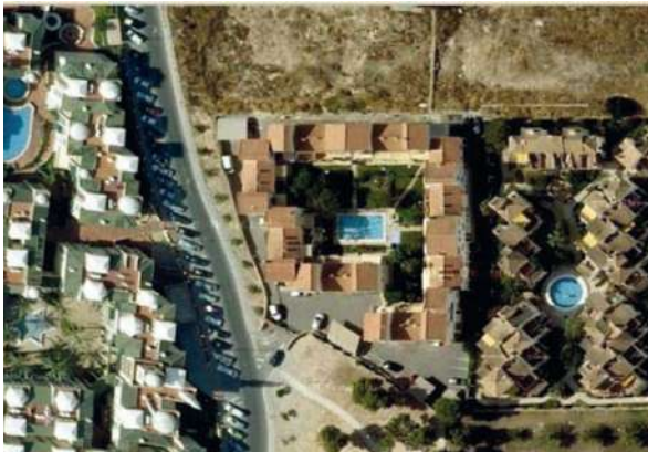
Playa Varadero Bungalows | Santa Pola, Alicante