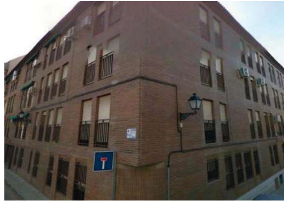
Avda. Plaza de Toros Building | Toledo