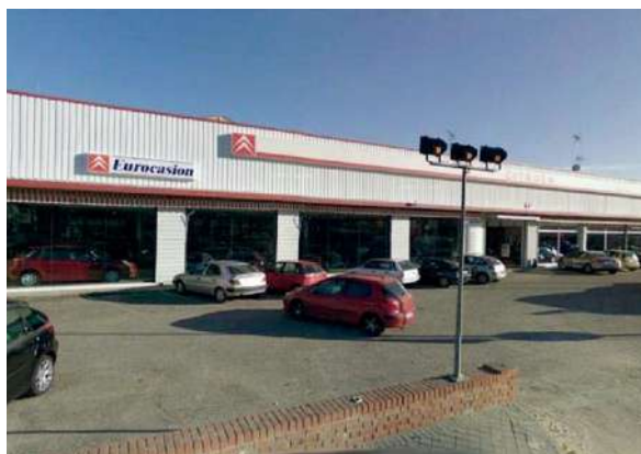
Industrial Plants | Ctra. Madrid - Toledo