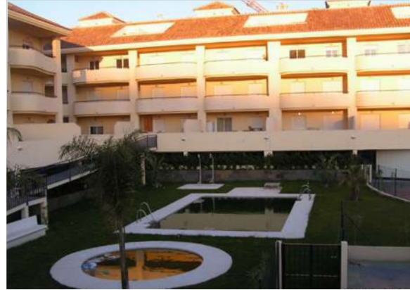
Panoramic Residential Complex | Benalmádena, Málaga