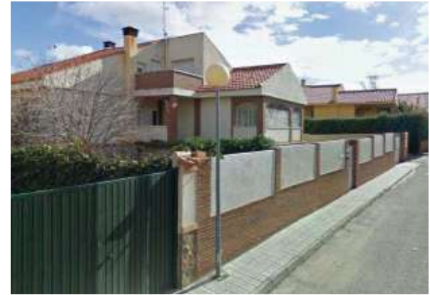
Las Nieves II Complex | Nambroca, Toledo