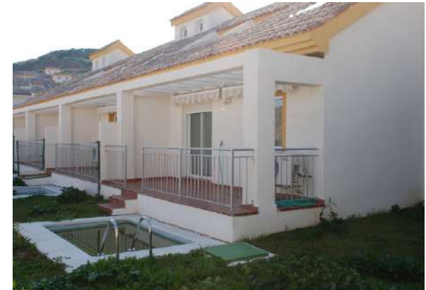
Villas La Viñuela II Residential Complex | Benalmádena, Málaga