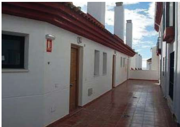
Pueblo II Apartments | Benalmádena, Málaga