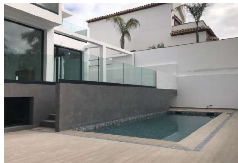
La Noria Golf | La Cala de Mijas, Málaga