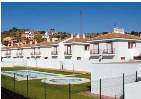
Rural Almogía Residential Complex | Almogía, Málaga