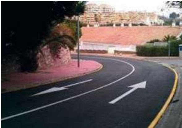
Redesign-Ronda del Golf | Benalmádena, Málaga