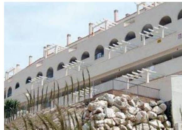
Eurogolf Building | Benalmádena Costa, Málaga