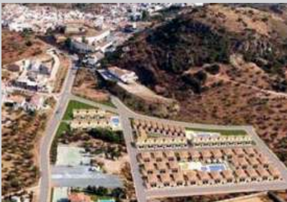
Area SP-6A | Benalmádena, Málaga