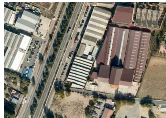
Industrial Plants | Ctra. Madrid - Toledo