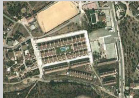
Area UR-2 | Almogía, Málaga