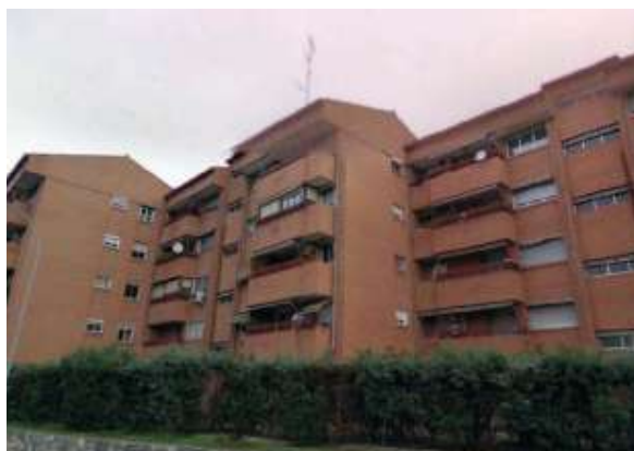
Avda. de Portugal Building | Toledo