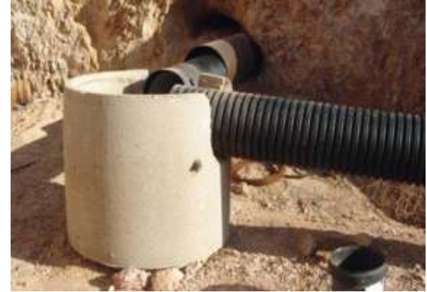
Sewerage SP-1 | Benalmádena, Málaga