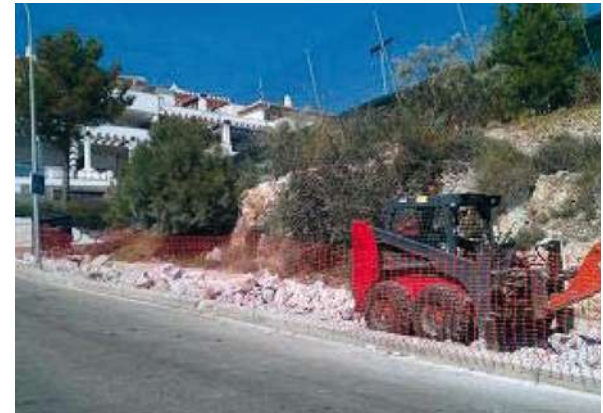
Ring road closure | Benalmádena, Málaga