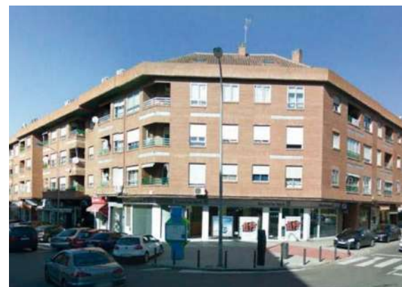
Barrio Sta. Teresa Buildings | Toledo