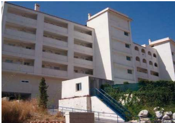
Golf Beach III Residential Complex | Nueva Torre- quebrada, Benalmádena, Málaga