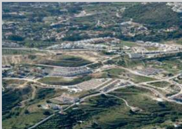
Area SP-11 | Benalmádena, Málaga