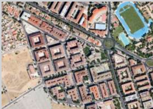
Barrio de Sta. Teresa | Toledo