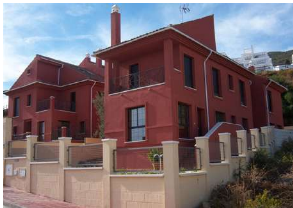
Los Nadales Villas Residential Complex | Benalmádena, Málaga