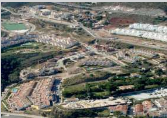
Area SP-6A | Benalmádena, Málaga